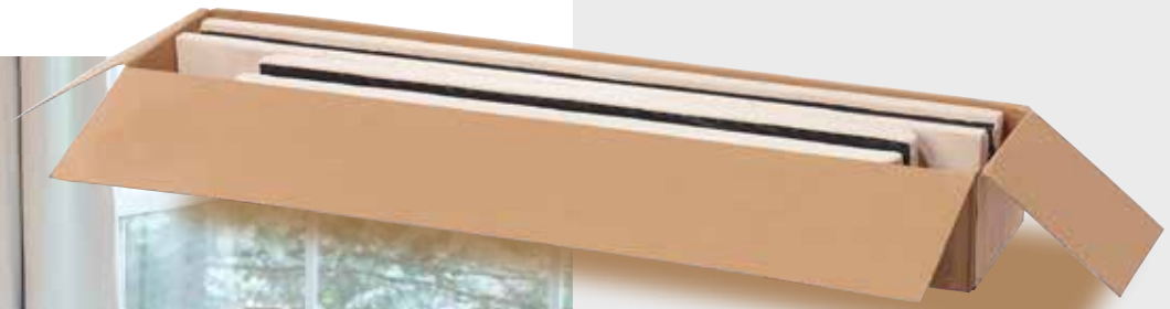
Packaged in a UPS shippable box